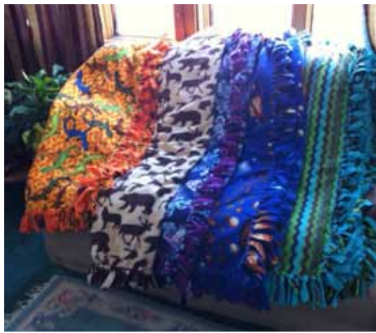
blankets created by fairbanks congregation members go to people in need