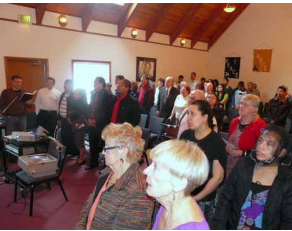
service at bend congregation with iglesia apostolica